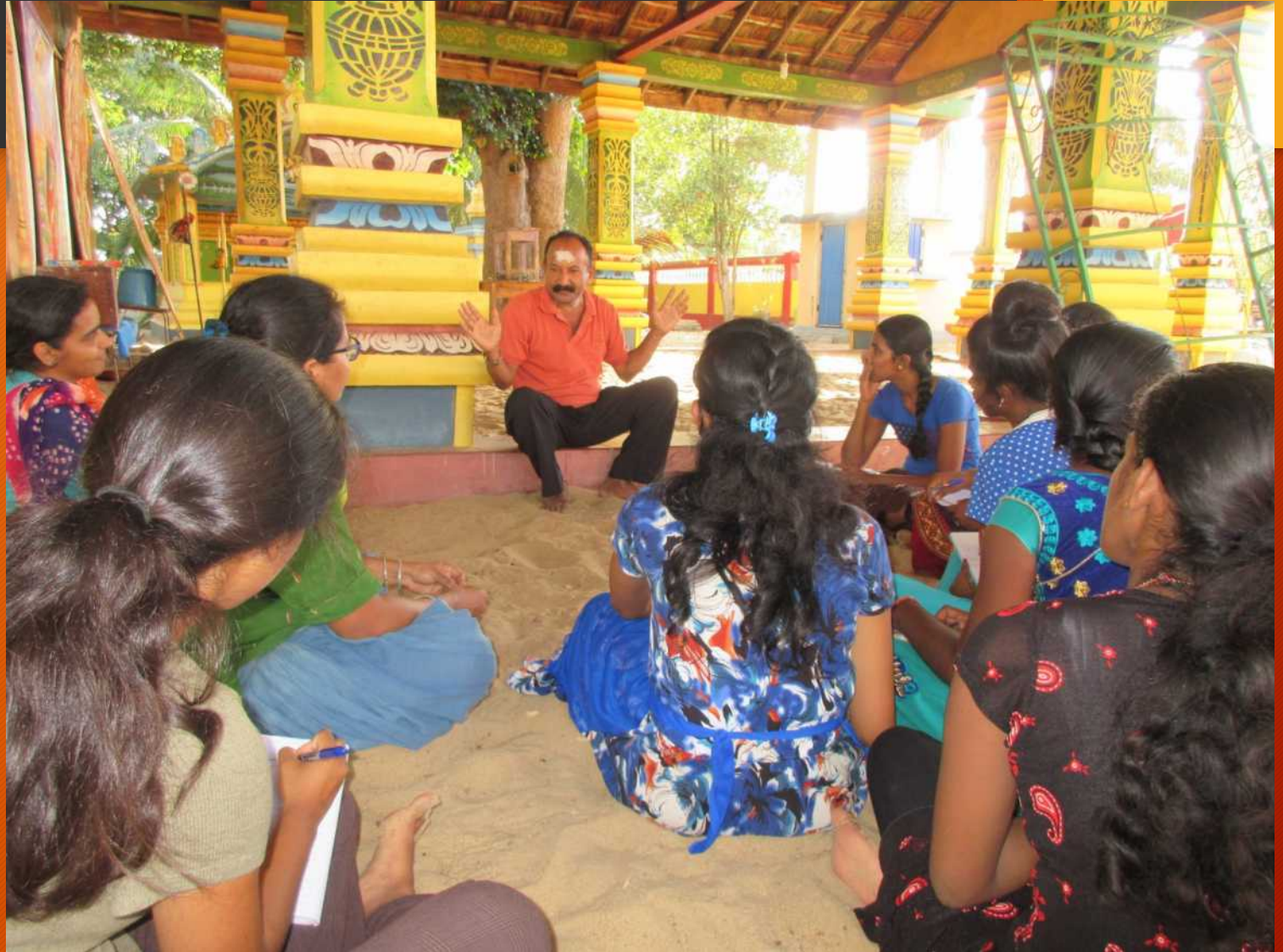
Sathurukondan Massacre Memorial September 9, 1990