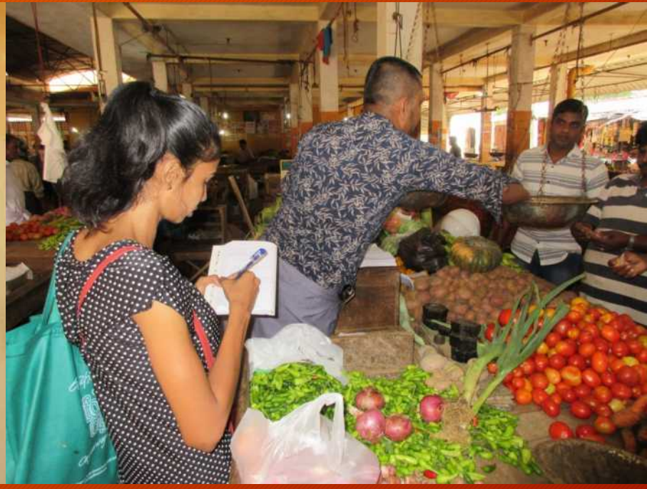
Batticaloa Main Market