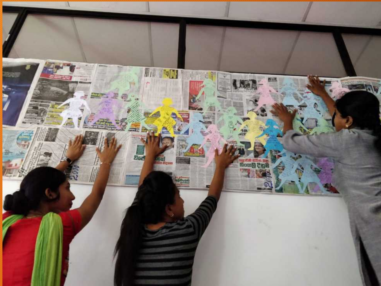
“River of Life”