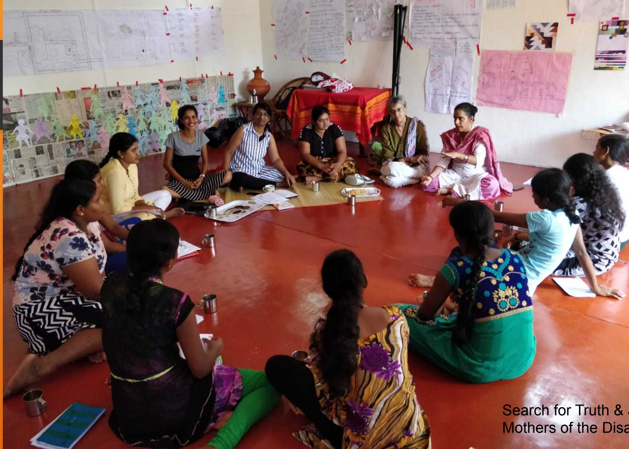
Search for Truth & Justice Mothers of the Disappeared