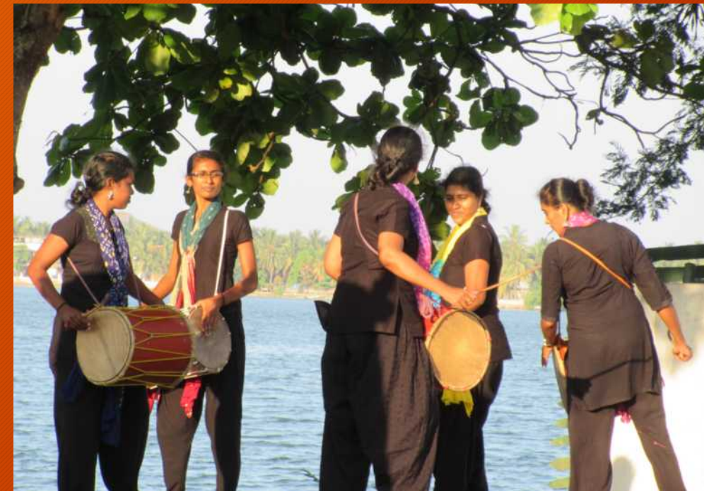
Women's Parai Drumming Performance