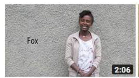
Learn Ethiopian Sign Language: Wild Animal Signs