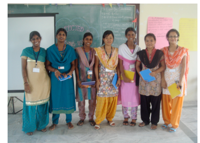
The 7 university women selected to be Visions leadership advisors.

The second training was held for secondary school students who attend 2 schools also run by the college. These 48 young men & women engaged in lessons pertaining to communication, problem-solving, trust & teamwork, meeting skills, and much more during the 5-day period. Students also worked in small leadership groups to plan and carry out various activities on the last day of the training.