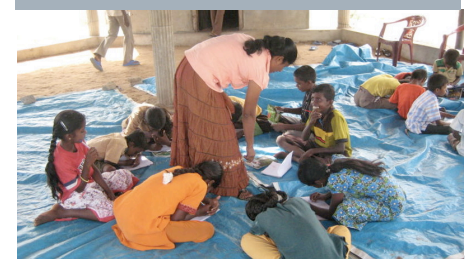
Teacher Training .04