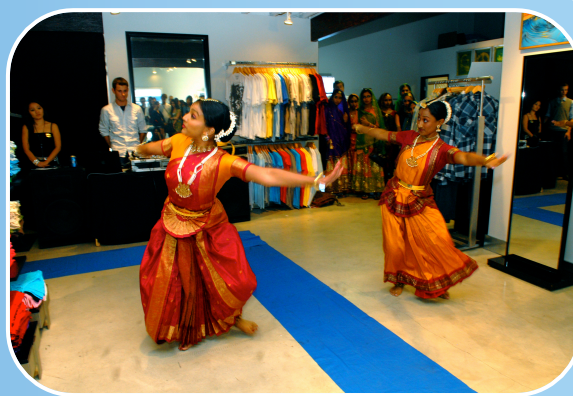
A committed group of volunteers in San Diego, CA has successfully held a charity fashion show for 3 years in a row, raising much-needed funds for educational projects in South Asia.

As we continue to grow and expand our efforts, we are always seeking new individuals who are passionate about education & service and would like to get involved. We are very pleased to welcome our many new Visions Chapter Coordinators and the teams of volunteers they have mobilized in their respective universities & communities. If you are interested in joining an existing Visions Chapter, we now have groups in Los Angeles, San Diego, Northern CA, Oregon, Austin, New York City, Boston, Philadelphia, and Toronto . Please email visionseducation@gmail.com for more information about starting a new chapter or getting involved in one of the chapters listed above.