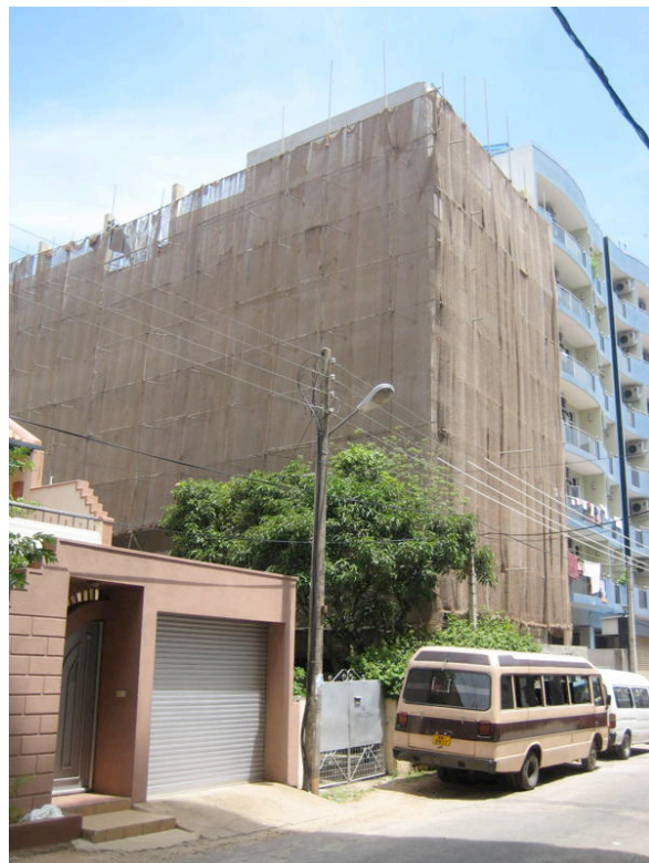
View of the progress of the KVLC construction from street view—August 2010

Teacher professional development and training is a tremendous need, particularly in areas affected by poverty and conflict. One of Visions main efforts is to coordinate and organize teacher training programs by connecting experts in a particular subject to a group of teachers in need of additional support. Possible training topics include psychosocial support, English, IT, and Leadership & Life Skills. Throughout 2011 we intend to support many such initiatives in both Sri Lanka & India and provide teachers with the basic supplies and other support they need to serve the best interests of their students.