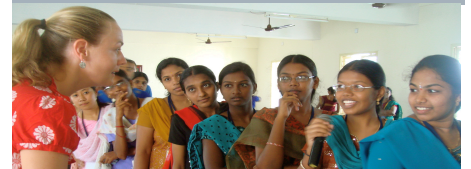
Leadership Program .03