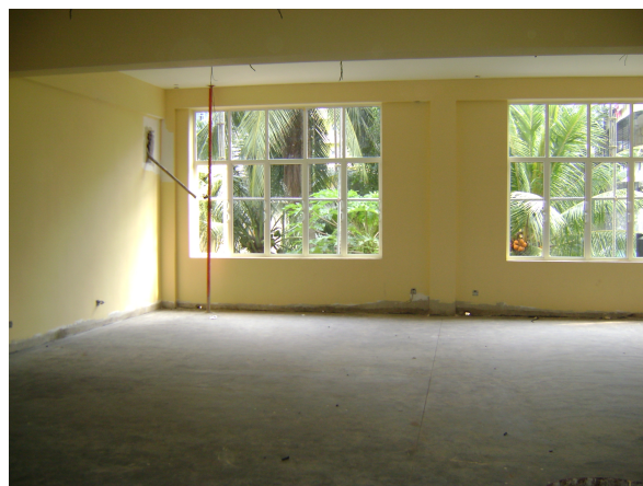
Interior progress on the KVLC—November 2010