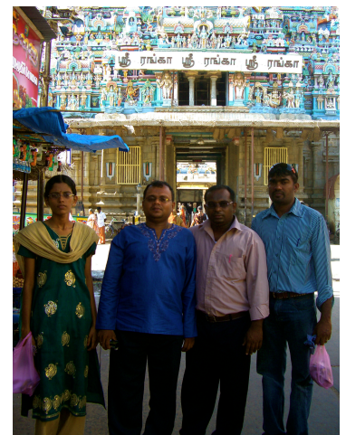
The group of 4 representatives from Sri Lanka who joined us in India.