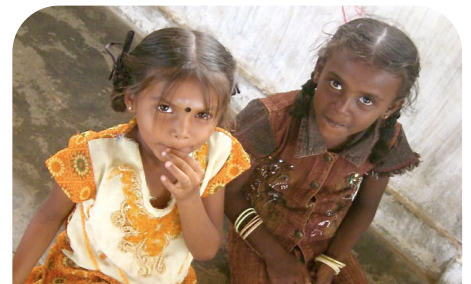
Youth IDP Relief .02

2010 has been an electrifying year for Visions...we have further developed our programming and our repertoire of reputable local partner organizations; we unveiled our new website; we opened 9 chapters and welcomed a whole team of new Chapter Coordinators; we held our annual leadership trainings in India for the third year running; and construction of our Kalagam Visions Learning Centre ( a project which has been in the works for over 3 years ) is nearly complete. Through all of these efforts and more we have been able to directly help hundreds of disadvantaged young people, teachers, & others in South Asia this year and indirectly help thousands. We are pleased to be able to share our accomplishments here with you in this annual report. Through the support and generosity of our donors & volunteers, we have been able to spark change and hope in schools and communities where it is needed most. As former UN Secretary General Kofi Annan once said, "Education is a human right with immense power to transform. On its foundation rest the cornerstones of freedom, democracy and sustainable human development." Thank you for your belief in our organization as we seek to change patterns of inequality by supporting educational initiatives for youth affected by poverty and conflict.